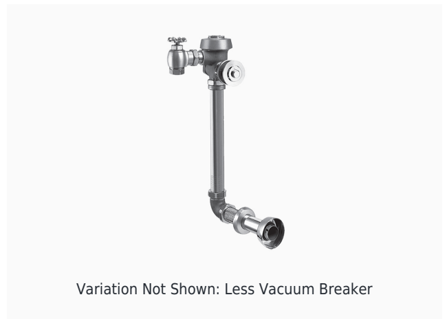
Variation Not Shown: Less Vacuum Breaker